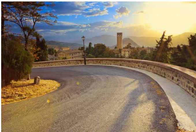
TOP: Time to pull over and sample sweeping views from the clifftops below the Forte di San Leo, built by the Romans to capitalise on the vantage point. ABOVE: La dolce vita – mediaeval towns, superlative wines, and the thrill of driving an Italian masterpiece.

Republic of San Marino (a microstate 70km away) and all these unknown hill towns,” he says. “And San Leo.” Cue a wide smile. “San Leo is essential.”