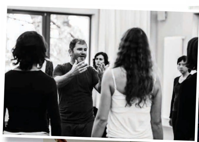
Courses include Middle Eastern Percussion, Circle Singing, Afro-Cuban Batá Drumming & Orisha Songs and Middle Eastern Maqam Ensemble