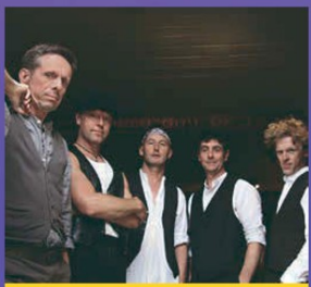
FRI 24 MARCH