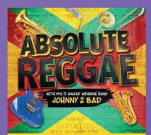
FRI 17 MARCH